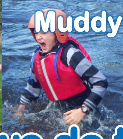
Muddy puddle jump